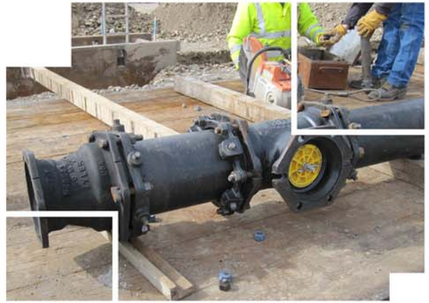
J & D Family Subdivision, Bozeman, Montana.