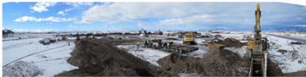
MUNICIPAL WATER STORAGE & DISTRIBUTION SYSTEMS

Our solid relationships with the many reviewing agencies allow us to guide your project through the regulatory environment and produce cost effective designs that get approved. Our core design objectives promote reliability and ease of maintenance for all your water supply, storage, and distribution engineering needs.