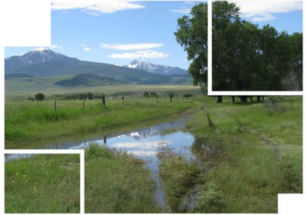
YP Livingston, Montana.