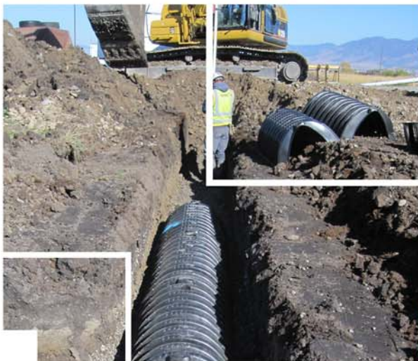
J & D Family Subdivision, Bozeman, Montana

For existing structures and infrastructure in or near river floodplains, we can help you assess your risk exposure through precise mapping and hydraulic analysis using HEC-RAS and other modeling software. Our goal is to mitigate impacts through cost effective solutions that obtain regulatory approvals.