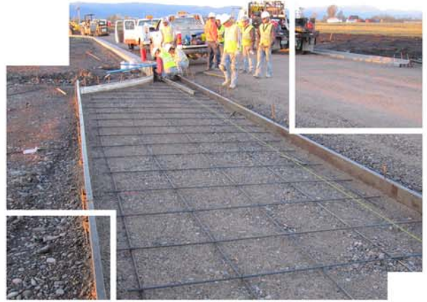
J & D Family Subdivision, Bozeman, Montana.