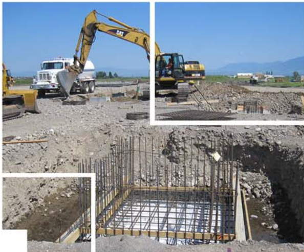
Billion Auto Complex II, Bozeman, Montana

GENESIS ENGINEERING, INC. 204 N. 11TH AVE. BOZEMAN, MT 59715 406 - 581 - 3319 www.g-e-i.net cwasia@g-e-i.net