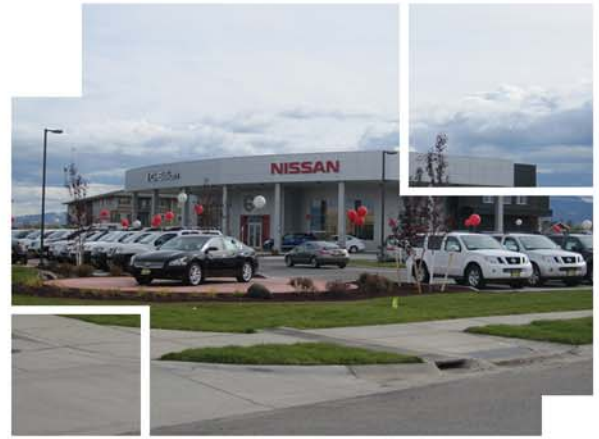
Billion Nissan, Bozeman, Montana.